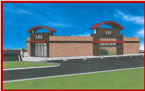
Architectural Rendering Holloway Street Location