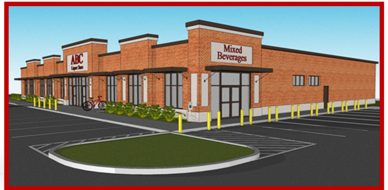
Architectural Rendering Hwy 55 Location