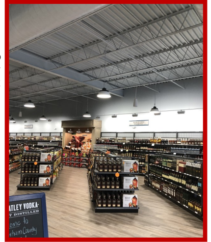
Riverview Shopping Center Location

Our first new location opened on August 3, 2020 in the Riverview Shopping Center on N. Roxboro Street. This location showcases the vision of what our new stores will look like. Not only have we created a shopping experience, but are also able to add more space to store adequate inventory and add 350 new products to offer a broader selection to our customers. The new spaces will also make improvements in safety learned from COVID-19 to reduce high touch areas. These include: 1) automatic entry doors, 2) large space to allow social distancing, 3) permanent safety shield at point of sale, and 4) counters designed that allow customers to bag and scan their purchases to decrease touching.